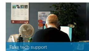
Fake tech support

Choose one of the scenarios below to get started. The interactive videos may not work on some smartphones.